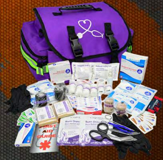
Small Medic First Responder EMT Trauma Bag Stocked First Aid Fill Kit A