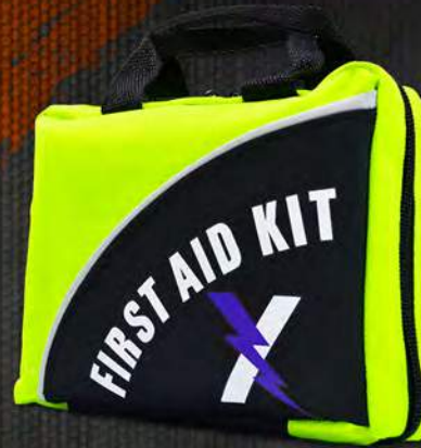
Hi-Vis 104 Piece Emergency First Aid Survival Kit w/ Bag for Camping, Workplace, Travel & Sports.