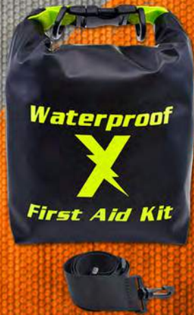
Lightning X Waterproof Hi-Vis First Aid Kit – 104 Pieces w/Dry Bag for Emergency, Survival, Camping, Boating, Hiking & Sports