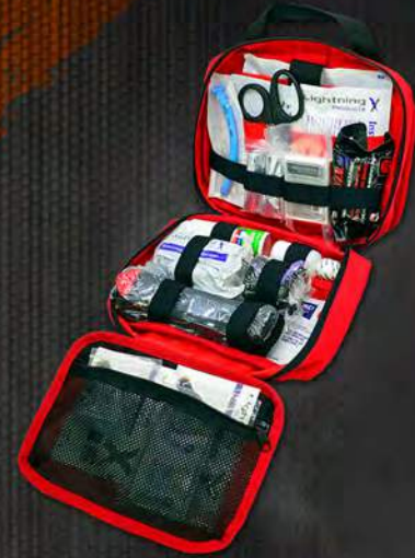
Large Rip-Away IFAK Trauma Bag for Car Head Rest - Laser Cut MOLLE Compatible Pouch