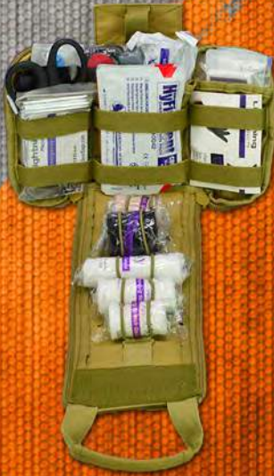
Spread Eagle Complete Tactical Gunshot & Trauma IFAK Kit w/Laser Cut MOLLE.