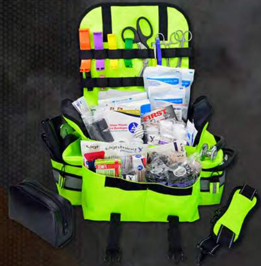
Small EMT First Responder Bag w/ Standard First Responder Fill Kit