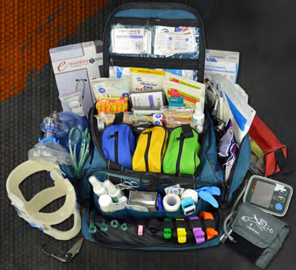
MB35 Modular trauma bag with removable color coded pouches and SMK-F premium fill kit