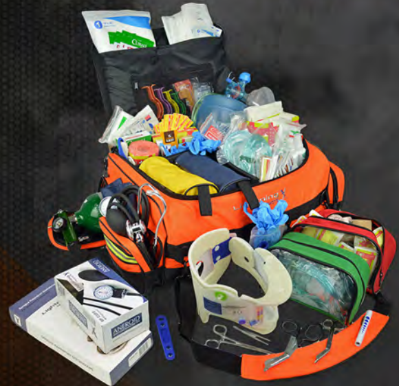
MB65 Modular oxygen trauma bag with removable color coded pouches and SMK-D advanced fill kit with oxygen cylinder and regulator