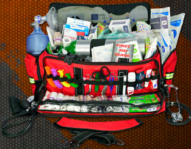
MB50 Deluxe oxygen trauma duffel and SKD advanced fill kit with oxygen cylinder and regulator